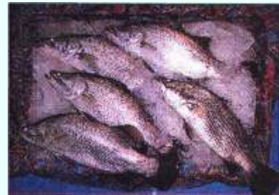
Fresh: the harvester’s barramundi.

Cell Aquaculture shares firmed slightly to 9¢.